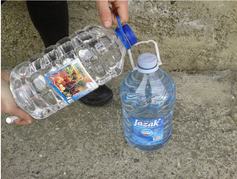
half vinegar (left bottle) + half water = vinegar-water