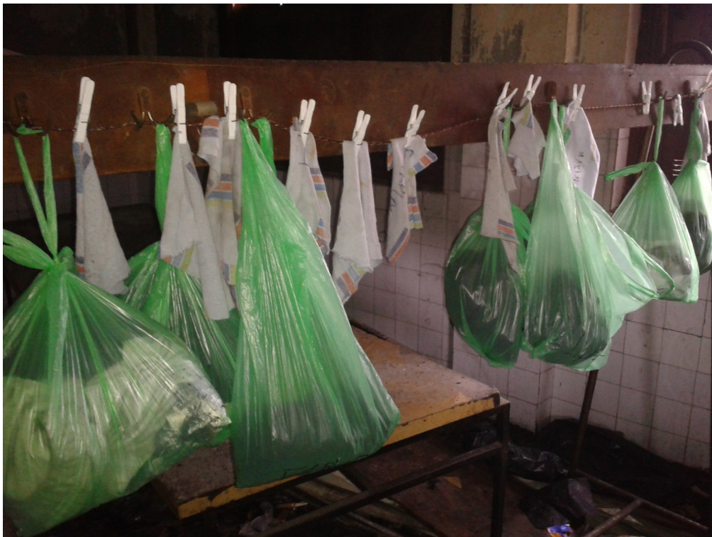
cloth-line with wash-cloths and individual bags with scabies- underwear